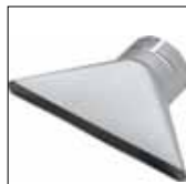
Item No. 4022 Wide slot nozzle 150 x 10 mm, for model 3000, 3000E