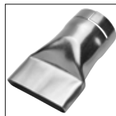
Item No. 4030 Wide slot nozzle 70 x 10 mm