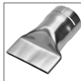
Item No. 4031 Wide slot nozzle 70 x 4 mm